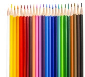
Colores Pencil Quantity: 1 Pack