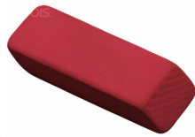
Erasers Quantity: 2