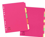
Subject Dividers Quantity: at least 10 Subject dividers