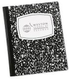
Composition Notebook Quantity: 8 Marble Composition Books