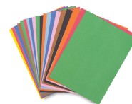
Long Multicolor Construction Paper Quantity: 1 pack 8 1/2 x11