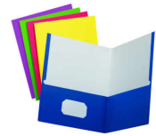
Pocket Folder Quantity: 1 for each subject for each subject