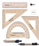
Geometry Set Quantity: 1 set Clear plastic tools