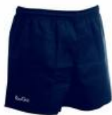
Blue Shorts School Logo