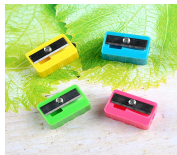
Sharpener 1 sharpener no electrical