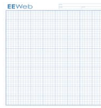
Graph Paper Quantity: 1 Pack For Geometry