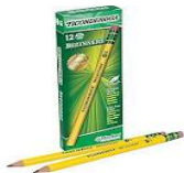
No. 2 Pencil Quantity: 1 box