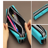
Pens/Pencils Container With Zipper