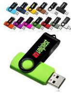
USB Flash Driver Quantity: 1