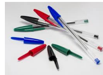
Pens red/black/ blue ink ball pens