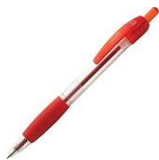
Red Pen Quantity: 1