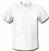
White T-shirt School